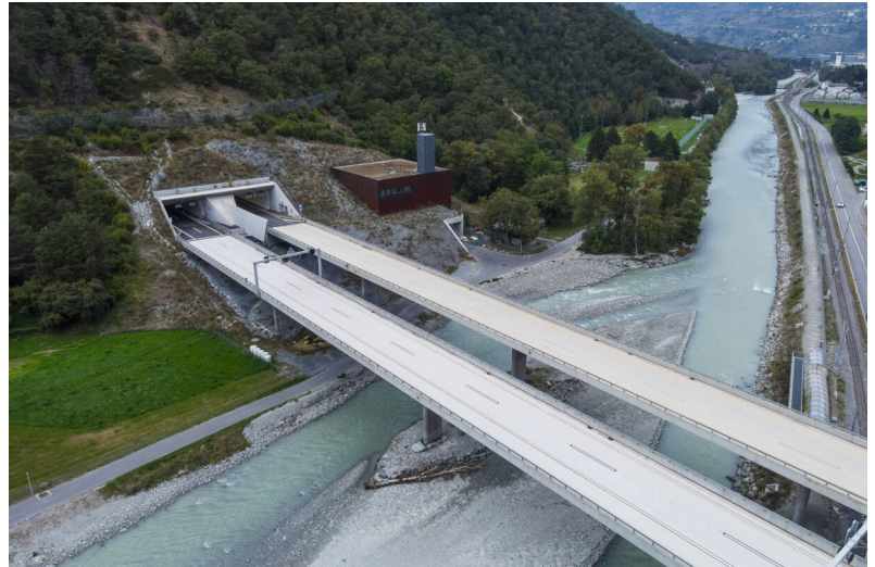
Eyholz tunnel after completion of the construction work

In the existing Vispertal Tunnel the intermediate ceiling will be rebuilt and adapted to the new ventilation system with jet fans in the tunnel and air will be extracted via