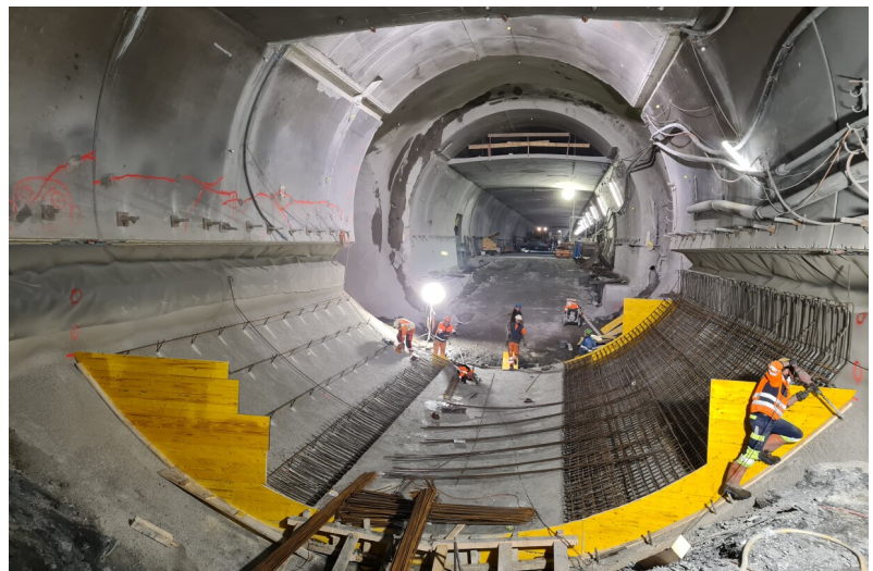
Vispertal tunnel under construction